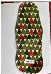
Top layer with waterproof inside