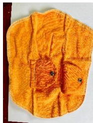
Absorbent part/Towel with wings

Note: You can join the top layer with the waterproof and absorbent layers to create a single piece instead of two separate parts. However, in communities like Tanzania, it is preferred to keep them as two pieces so they can dry more easily during the rainy season when there is limited sunlight.